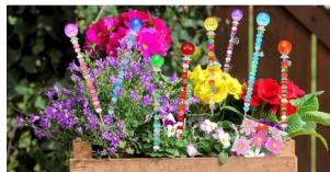
June 5 Garden Fairy Wands

Crafting is for grown-ups too, not just kids! Connect, create, and relax with others in an easygoing environment. All supplies for our simple crafts provided – you just need to bring the conversation and imagination! To help with the purchasing of supplies, please consider a donation of $3 per craft.