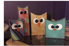
August 7 2 x4 Owls