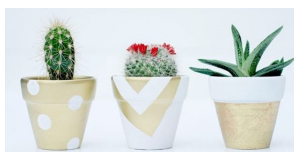
March 6 Painted Mini succulent pots

Crafting is for grown-ups too, not just kids! Connect, create, and relax with others in an easygoing environment. All supplies for our simple crafts will be provided – you just need to bring the conversation and imagination! To help with the purchasing of supplies, please consider a donation of $3 per craft.