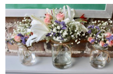
April 3 Flower arrangements