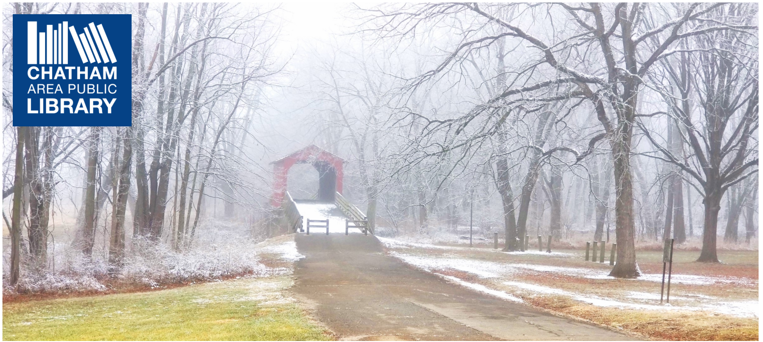
Sugar Creek Covered Bridge