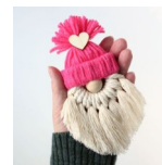
February 7 Valentine Macrame Gnome