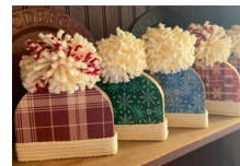
January 3 Wooden hats