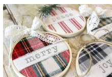
December 6 Embroidery Hoop ornament

Crafting is for grown-ups too, not just kids! Connect, create, and relax with others in an easygoing environment. All supplies for our simple crafts will be provided – you just need to bring the conversation and imagination! To help with the purchasing of supplies, please consider a donation of $3 per craft.