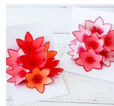
February 20 Pop-Up Flower Card