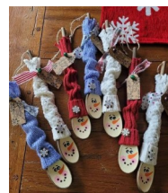
January 16 Wooden Spoon Snowmen