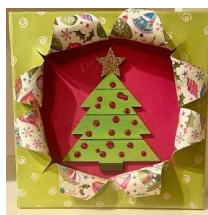
December 19 Busted Canvas Art

Whether you're an experienced crafter or just looking to try something new, our friendly gatherings offer the perfect opportunity to connect, create, and discover new skills in a relaxed, welcoming atmosphere. To help with the purchasing of supplies, please consider a donation of $3 per craft.