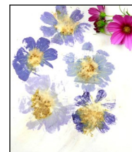
July 2 Hammered Flowers Print