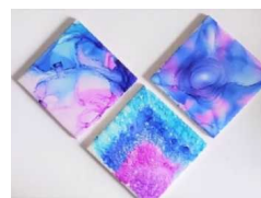
Jul 17 Alcohol Ink Coasters