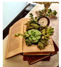
August 6 Book Planter