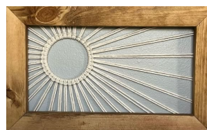
June 4 Framed Macrame Sun

Crafting is for grown-ups too! Connect , be inspired , and relax with others in an easygoing environment. All supplies for our simple crafts provided – you just need to bring the conversation and imagination! To help with the purchasing of supplies, please consider a donation of $3 per craft.