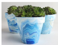
June 26 Drip Pots

Whether you're an experienced crafter or just looking to try something new, our friendly gatherings offer the perfect opportunity to connect, create, and discover new skills in a relaxed, welcoming atmosphere. To help with the purchasing of supplies, please consider a donation of $3 per craft.