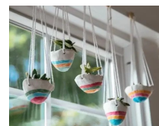
August 21 Pinch pots