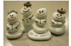
November 20 Pebble Snowman