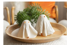
October 16 Clay Ghosts