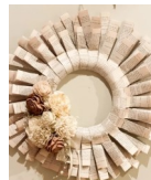
September 18 Book Page Wreath

Whether you're an experienced crafter or just looking to try something new, our friendly gatherings offer the perfect opportunity to connect, create, and discover new skills in a relaxed, welcoming atmosphere. To help with the purchasing of supplies, please consider a donation of $3 per craft.